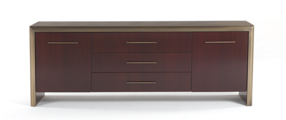
Sideboard with structure in beech wood and metal. Mahogany and bronzed finishings.

Sophisticated workmanship and elegant, luxurious details are the main characteristics of this important sideboard, suitable for any style and environment.